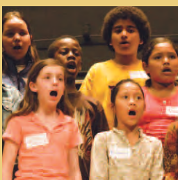
Minneapolis Youth Chorus