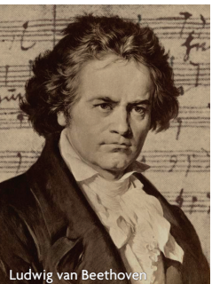
Ludwig van Beethoven